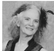
Chelydra Newport News, VA