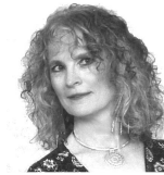
Chelydra Newport News, VA

Routines are limited to seven minutes (but remember, less is sometimes more). Music must be on CD-R (not CD-RW).