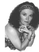
Chelydra Newport News, VA

Routines are limited to seven minutes (but remember, less is sometimes more). Music may be on cassette tape or CD. A tape backup of your CD is recommended.